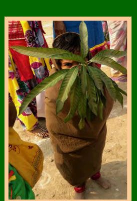
Plant A Tree

It is never too early to plant the seeds of renewal. Teaching children to work together to improve Planet Earth awakens a new love, respect and responsibility for the world in which they live.