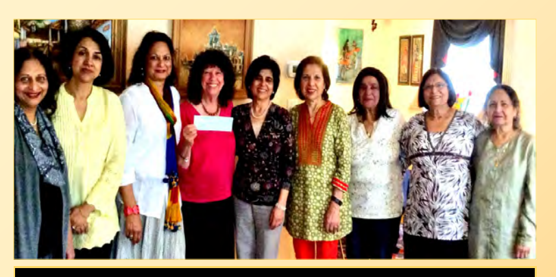
Women's Rehabilitation Group